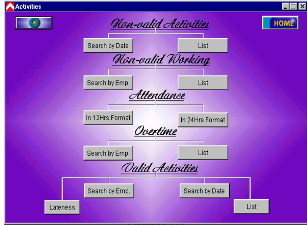
(b) Activity Table