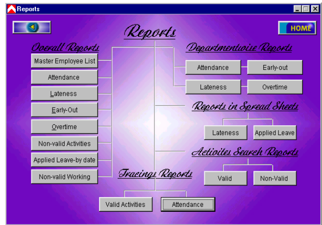
(d) Reports Menu